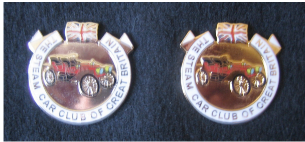
Silver PINS Gold $5 ea.