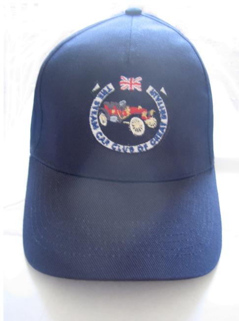
Caps - $20