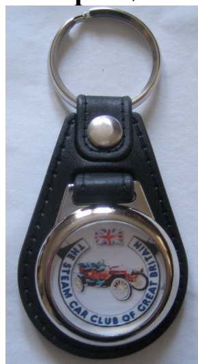
Key Rings - $8