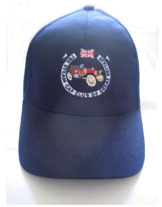
Caps - $20