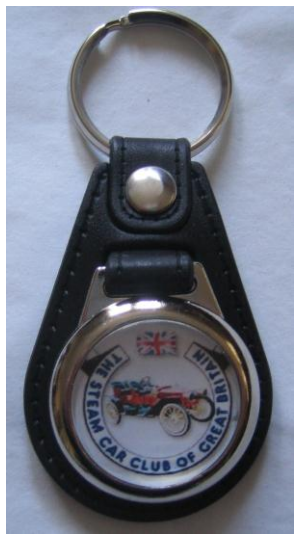
Key Rings - $8